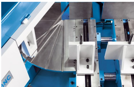
Cutting angle settings 0° - 45°