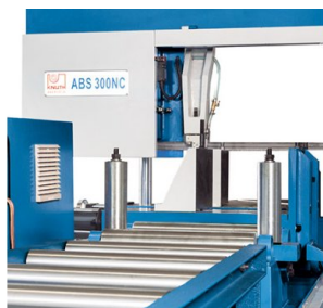
Standard roller conveyor extends the integrated material support area