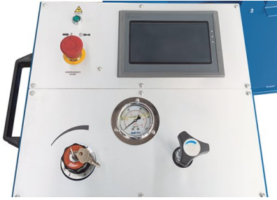
PLC with graphic touchscreen