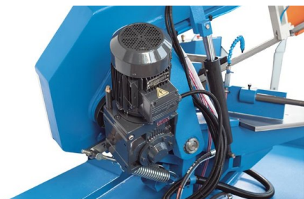
The compact drive unit delivers high torque