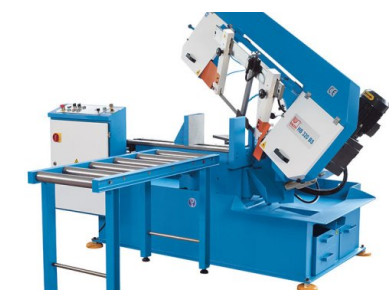
Rigid feed roller tables simplify material handling