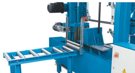
Solid feed roller table and material guide for workpiece bundles