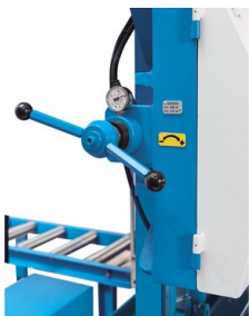
Pressure gauge for precise saw blade tensioning