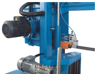
Powerful saw blade/feed motors and heavy-duty gears can handle demanding applications and high loads with quiet operation and minimal space requirement.