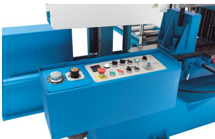
Pressure gauge for precise saw blade tensioning