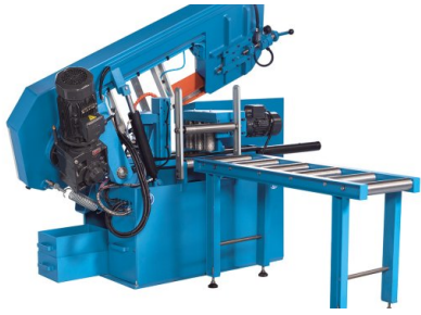
A motor with infinitely variable speeds transmits power via a continuous-operation idler gear to the machine drive wheel