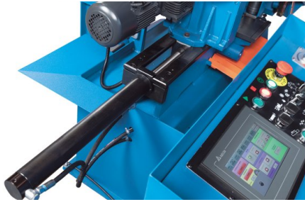
Hydraulic part clamping included in standard equipment