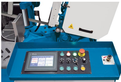
The touchscreen allows for easy and convenient programming for fully automated operation