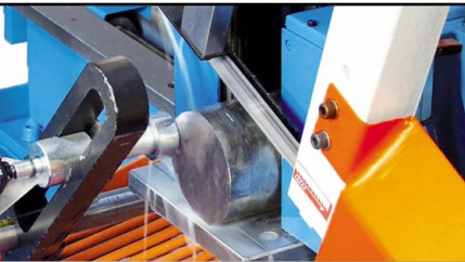
Automatic limitation of frame lift-off upon completion of the cut