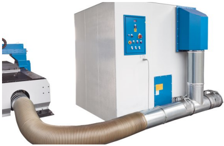
Dust vacuum and filter system available as optional equipment