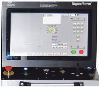
EDGE® Connect is the latest CNC platform by Hypertherm featuring superior reliability, powerful integrated functionality, and is highly customizable