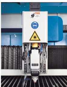
Cutter head with integrated collision guard, automatic focus positioning, and height control