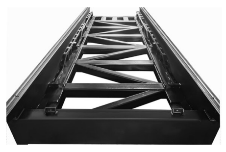
The frame is meticulously welded and thermal treated