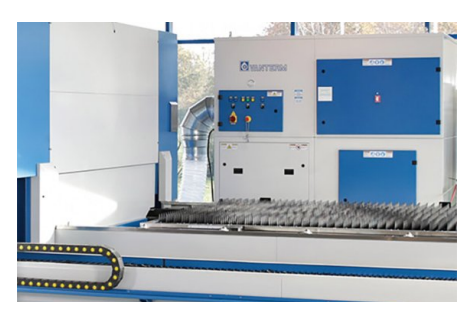
Machine comes standard with a dust collector and filtration unit and has 99,997% filtration efficiency