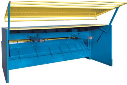
Accessible work area at the back gauge is secured by a swivel door