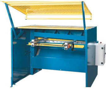
Swivel-mounted workspace enclosure ensures operator safety