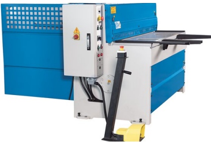
Back gauge is protected via sturdy enclosure and light curtain