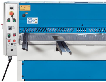
Robust lateral stop with scale