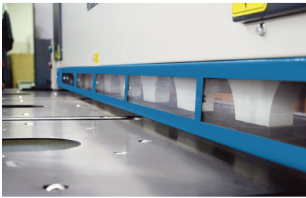
Material support rollers are recessed in the table for easy workpiece handling