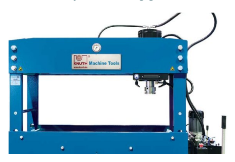
The hydraulic cylinder can be moved laterally and is clamped mechanically