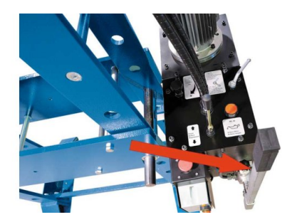
A hand pump is available for very delicate work