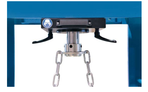
Table height can be adjusted easily via hydraulic lifting gear