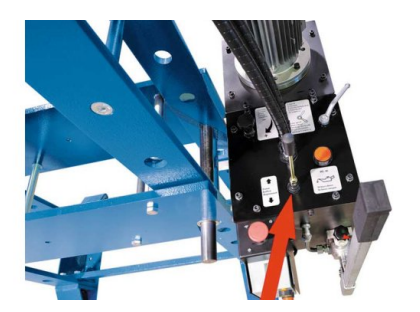
The press is operated via joystick