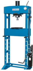
KNWP 30 is shown