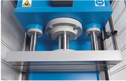
Two circular guides ensure maximum ram plate parallelism during stroke movement