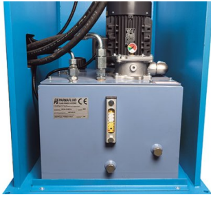
Space saving hydraulic system located accessibly inside the frame