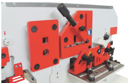
Compact design and excellent rigidity