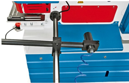
Back gauge with automatic cut activation

• Models HPS 45H and HPS 60 H feature a powerful hydraulic cylinder • Models HPS 65 H, HPS 85 H, HPS 115 H and HPS 175 feature 2 hydraulic cylinders allowing simultaneous operation at 2 stations