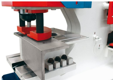
Hole punch station featuring large support table