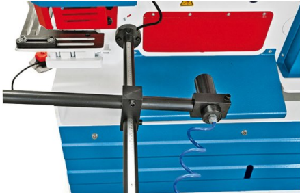
Back gauge with automatic cut activation

• Models HPS 45H and HPS 60 H feature a powerful hydraulic cylinder • Models HPS 65 H, HPS 85 H, HPS 115 H and HPS 175 feature 2 hydraulic cylinders allowing simultaneous operation at 2 stations