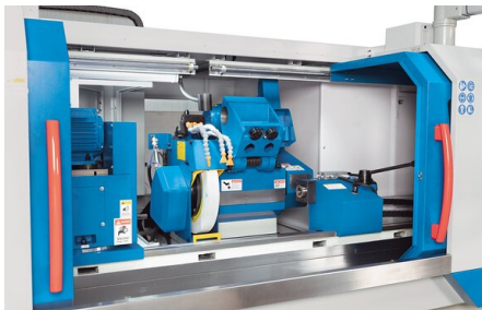
Wide-opening doors allow for easy access to the fully enclosed working area