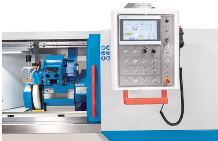
The touchscreen allows for easy programming of individual grinding cycles