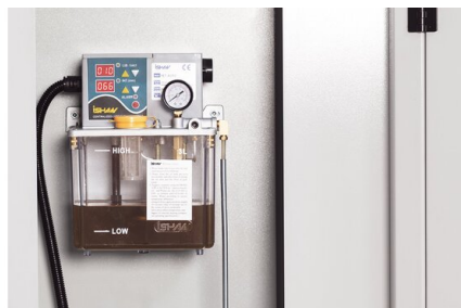
An automatic central lubrication system continuously supplies all lubrication points and simplifies maintenance. The lubricant is stored in a central reservoir and distributed via lines to all lubrication points. Lubricant is metered via electronic control