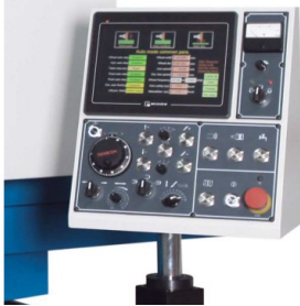
Touchscreen display for easy programming of grinding cycles