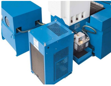
External hydraulic unit and oil cooler ensure thermal stability during continuous operation