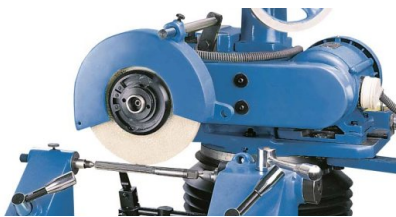
Swiveling headstock and extensive accessories