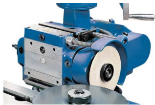
Saw blade sharpening