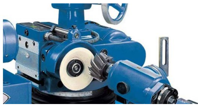
Rigid angle-adjustable workpiece mounts