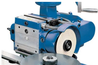
Saw blade sharpening