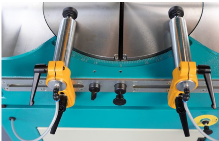
Adjustable pneumatic workpiece grips with large practical tensioning lever