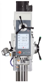
Drill Press 2.0 - access to all functions on a rugged touchscreen