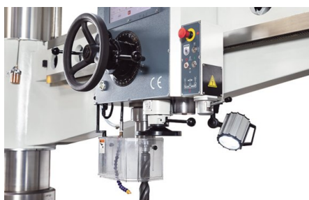
The rugged LED work light, with protection from sprayed water, is bright, energy-efficient, and promotes safe and productive work