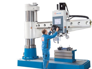
Swivel axis and travel axis feature extremely smooth operation to make the operator's everyday production work easier