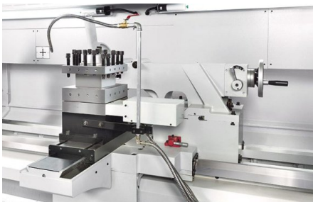
Easy handling: for positioning, the tailstock can be coupled to the support