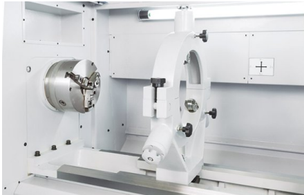
Option: steady rests up to 400 mm diameter