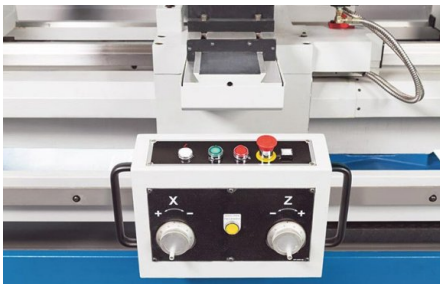
Compact control unit with electronic hand-wheels