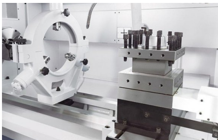
Automatic changing 4-fold steel holder