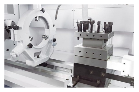
Automatic changing 4-fold steel holder