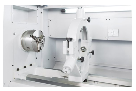
Option: steady rests up to 16 in diameter