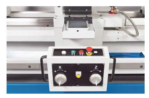
Compact control unit with electronic handwheels