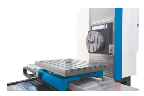
Setup table with manual rotation , CNC face slide as option